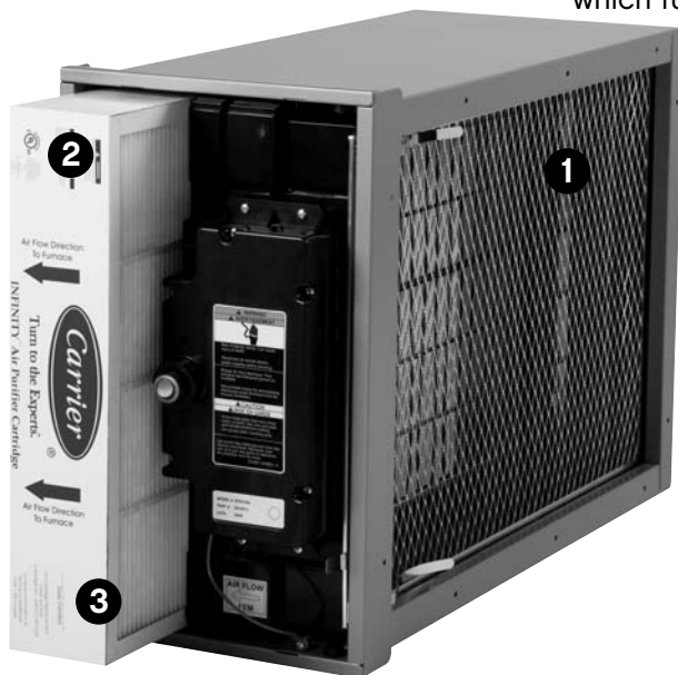
Gas Furnace Model

In step 3, the intense electric field established across the filter results in a charge separation across the captured pathogen's cell membrane and a stretching of the cell wall. The pathogen is also bombarded by negative ions from the ionization section, which further pushes the membrane towards rupture. The net result on captured pathogens is the rupturing of the cell membrane causing inactivation or death.