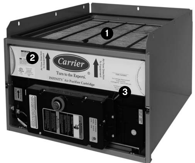
Fan Coil Model